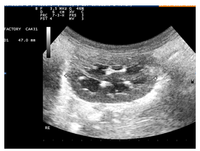
Fig.1. Measurement of length in the sagittal section of left kidney on a lamb (4.70cm).

The visualization of the kidneys by US was obtained successfully in the three groups, and renal architecture was preserved in all animals. In adults, it was more difficult to visualize the left kidney by the effect of reverberation produced due to the presence of gas in the rumen. However,